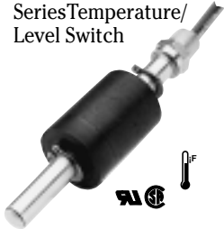
TH800 Series Temperature/Level Switch

Level monitoring and temperature switch in a single unit. Intermediate in size; single-setting temperature sensor is in bottom of stem.