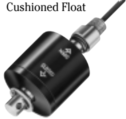
LS-38760 Series – Cushioned Float

Cushioned float and switch for turbulent liquids or excessive vibration. Easily grounded. Ideal for tank trucks, construction equipment or mobile applications.