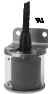
LS-270 Series – Bracket Mounting Slosh Shield

Cushioned float and switch for turbulent liquids or excessive vibration. Easily grounded. Ideal for tank trucks, construction equipment or mobile applications.